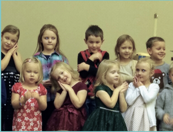
PRESCHOOL CHRISTMAS PROGRAM