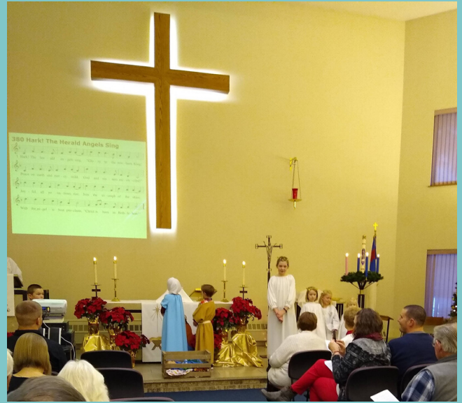
CHILDREN'S CHRISTMAS EVE SERVICE